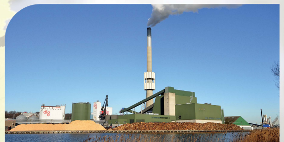
Plant Improvements, Retrofit, Fuel Conversion

Aalborg Energie Teknik a/s, Alfred Nobels Vej 21F, 9220 Aalborg E. Tel. +45 9632 8600, www.aet-biomass.com