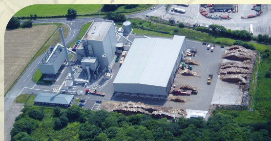
Biomass Fired Power Plants