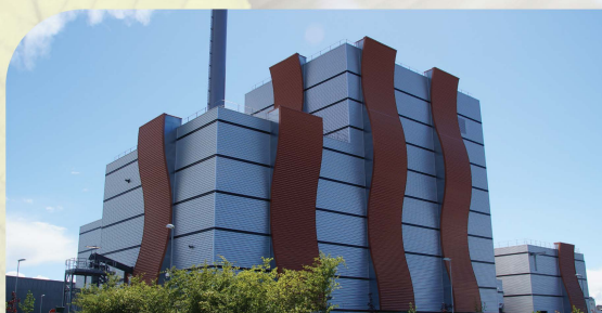
Biomass Fired Boiler Plants

AET is a leading independent engineering and contracting company which design, deliver, service, operate and retrofit biomass fired plants in the size from 25 -to 170 MWth. Our plants are characterised by exceptionally high boiler and plant efficiency, high availability, high fuel flexibility and low emissions.