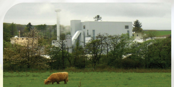
Biomass Fired Combined Heat & Power Plants